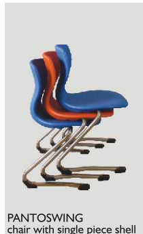
PANTOSWING chair with single piece shell