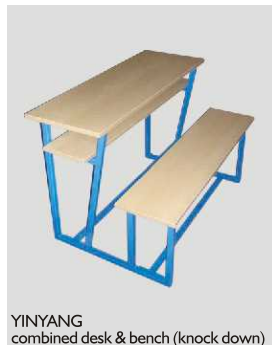
YINYANG combined desk & bench (knock down)