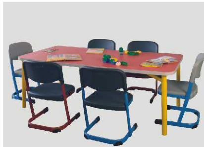
HAPPY TABLE 6 seater with LuPoGlide chairs