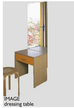
IMAGE dressing table