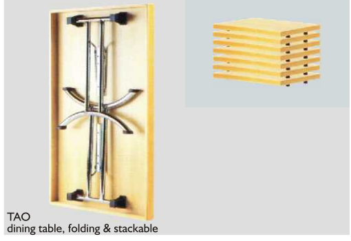
TAO dining table, folding & stackable