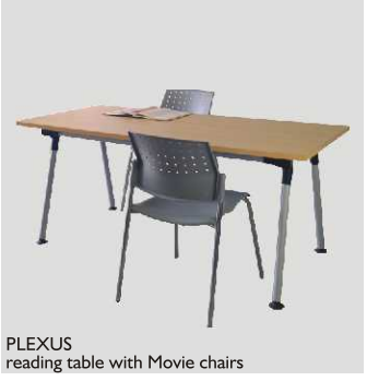
PLEXUS reading table with Movie chairs