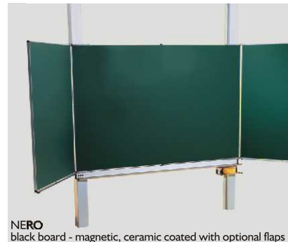
NERO black board - magnetic, ceramic coated with optional flaps