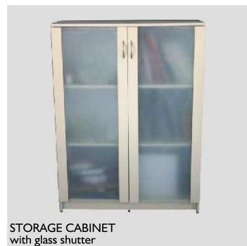
STORAGE CABINET with glass shutter