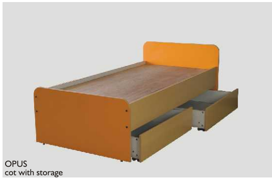
OPUS cot with storage