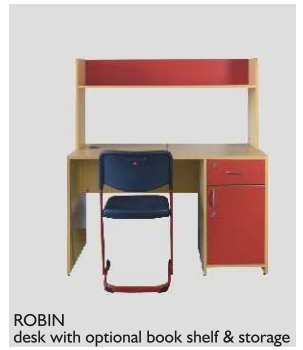
ROBIN desk with optional book shelf & storage