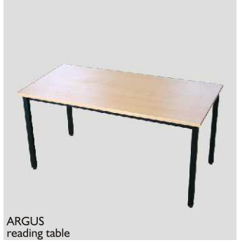
ARGUS reading table