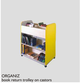
ORGANIZ book return trolley on castors