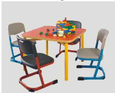
HAPPY TABLE 4 seater with LuPoGlide chairs