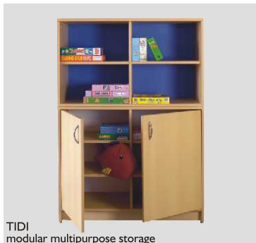
TIDI modular multipurpose storage