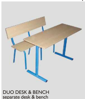
DUO DESK & BENCH separate desk & bench