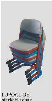
LUPOGLIDE stackable chair