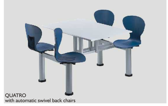
QUATRO with automatic swivel back chairs