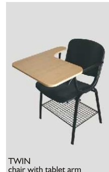
TWIN chair with tablet arm