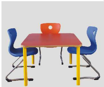
HAPPY TABLE 4 seater with PantoSwing chairs