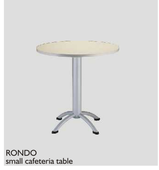
RONDO small cafeteria table