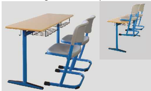
LIGNO LIGNOdur® desk with 'virtually indestructible' imported table top