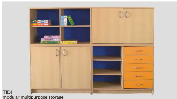
TIDI modular multipurpose storage