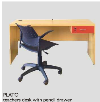
PLATO teachers desk with pencil drawer