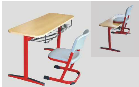
LAMINO desk with high pressure laminate top