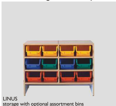
LINUS storage with optional assortment bins