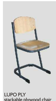
LUPO PLY stackable plywood chair