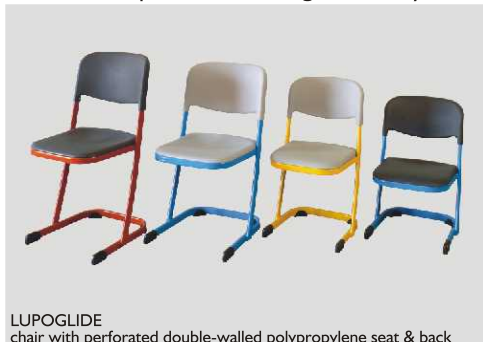
LUPOGLIDE chair with perforated double-walled polypropylene seat & back